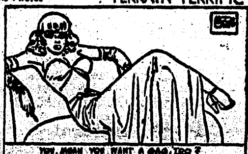
YOU, MAN. YOU WANT A GAG, TOO?